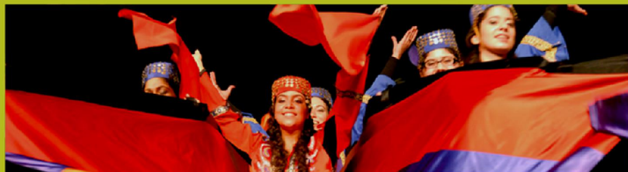
Live Music and Dancing Daily - Featuring the "Akh'tamar Dance Group"

matter. And he said to them, "Whoever divorces his wife and marries another, commits adultery against her; and if she divorces her husband and marries another, she commits adultery."