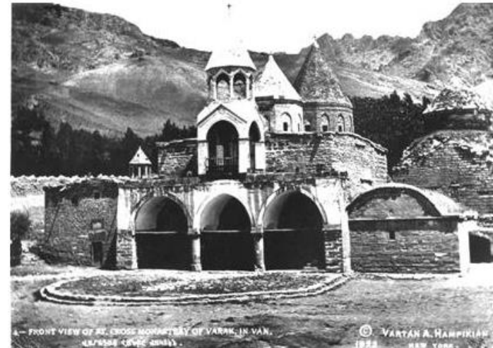
Holy Cross monastery of Varag, in Van